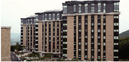
Comfortable dormitory (double occupancy)