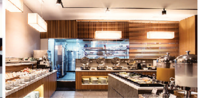
Meals made from fresh and healthy ingredients that will tantalize your taste buds